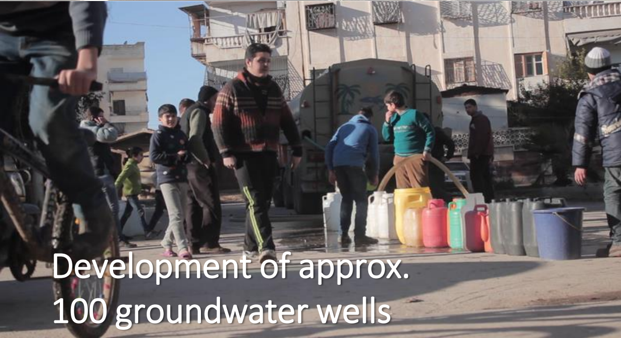
Development of approx. 100 groundwater wells