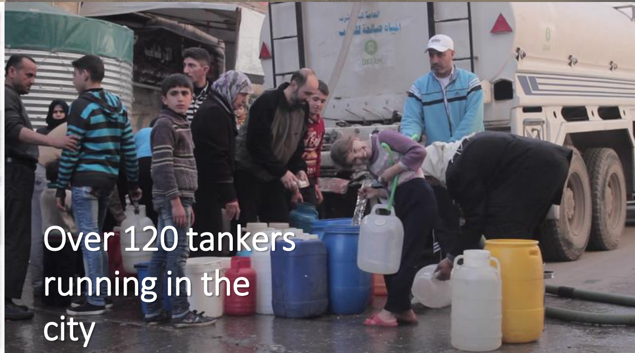
Over 120 tankers running in the city