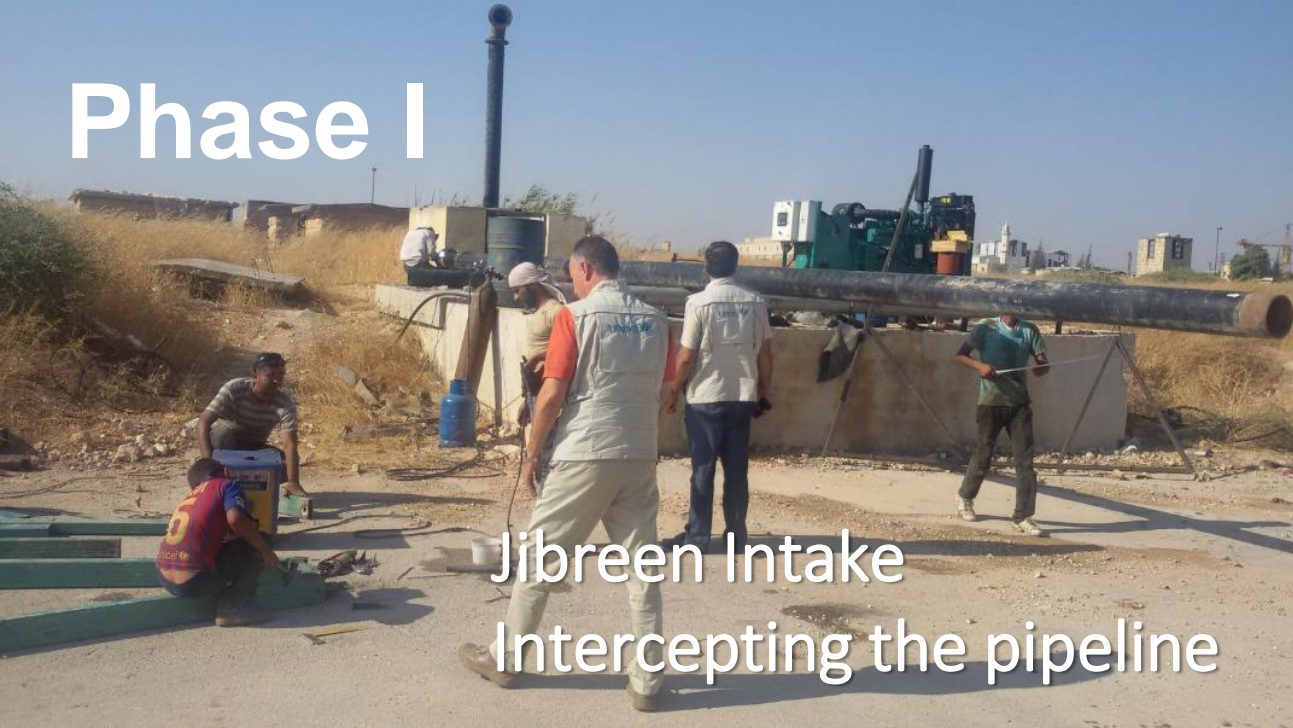
Jibreen Intake Intercepting the pipeline