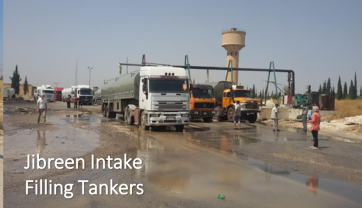
Jibreen Intake Filling Tankers